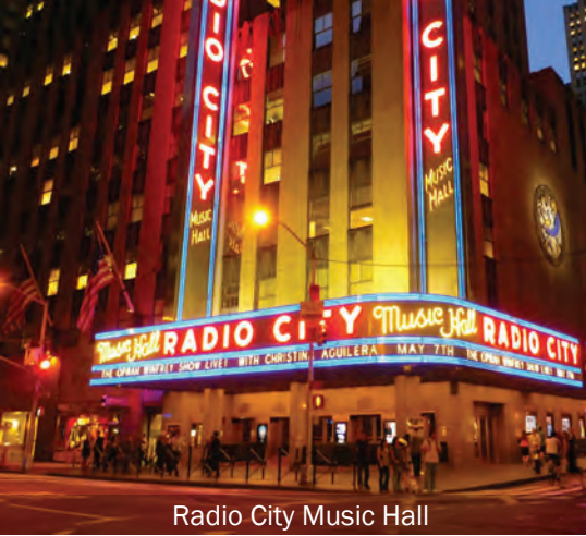
Radio City Music Hall