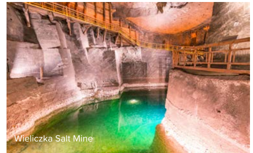
Wieliczka Salt Mine