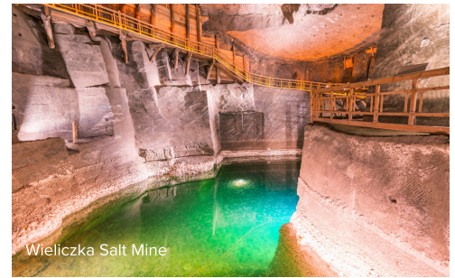
Wieliczka Salt Mine