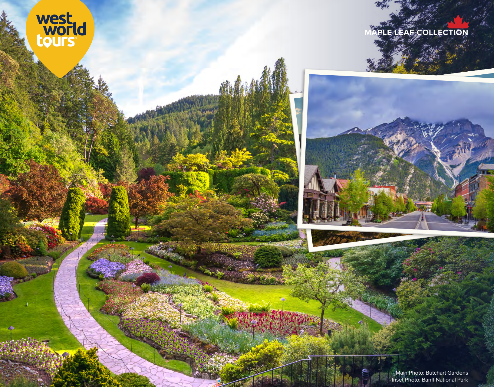
Main Photo: Butchart Gardens Inset Photo: Banff National Park