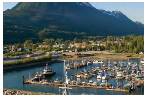
Skagway Boat Harbour

Board our coach for Butchart Gardens. For over 90 years this amazing 50 acre garden has been a symbol of Victoria's beauty. We will also stop at the Butterfly Gardens today.