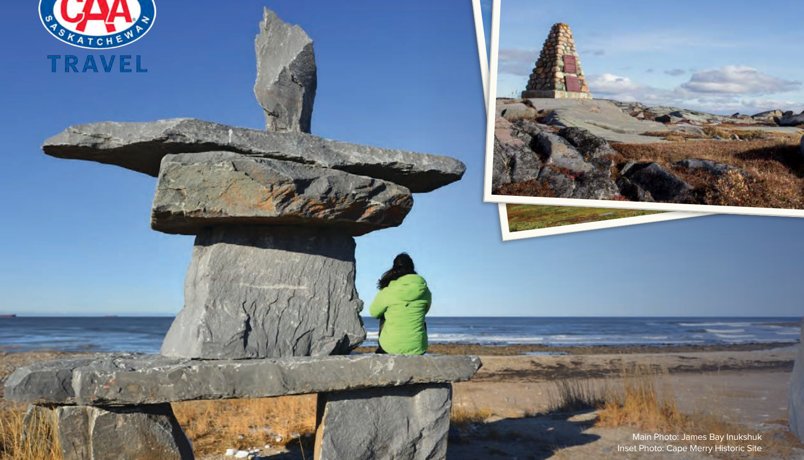
Main Photo: James Bay Inukshuk Inset Photo: Cape Merry Historic Site