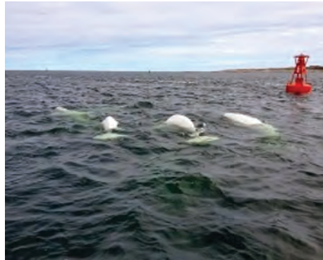
Beluga Whale Watching

*The timing for today is dependant on the tides.