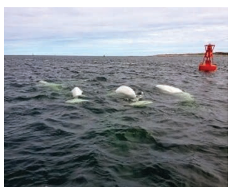
Beluga Whale Watching

*The timing for today is dependant on the tides.