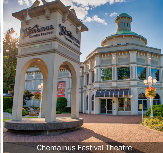
Chemainus Festival Theatre