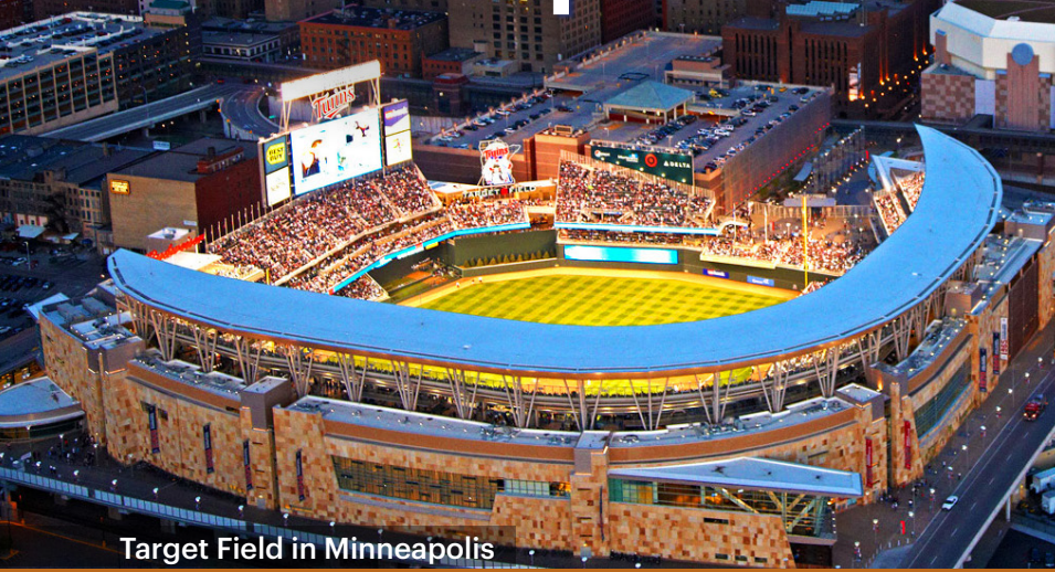
Target Field in Minneapolis