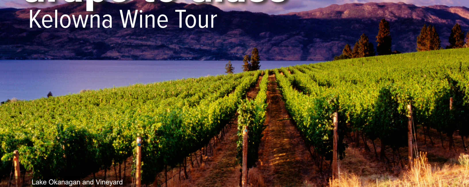
Lake Okanagan and Vineyard