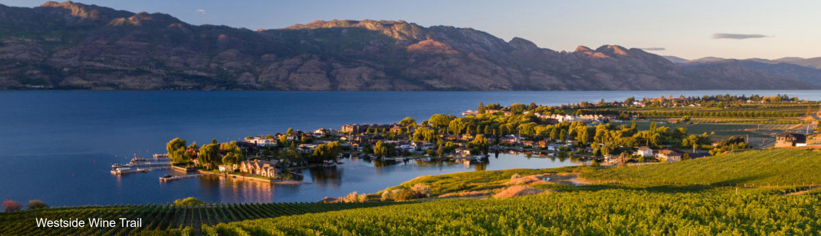
Westside Wine Trail

Winery. It's a day brimming with flavors and fun!