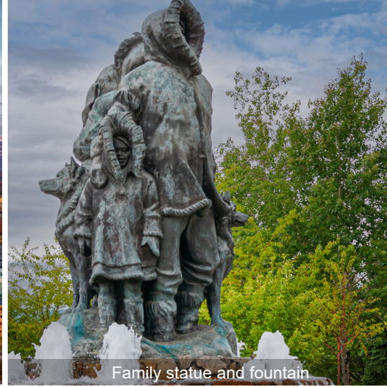
Family statue and fountain