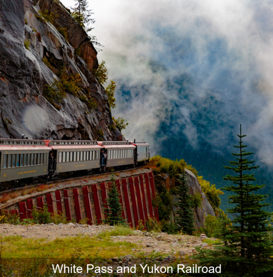
White Pass and Yukon Railroad