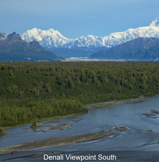
Denali Viewpoint South