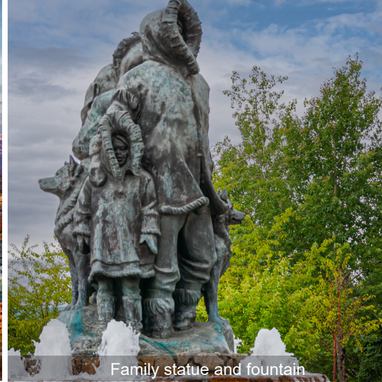
Family statue and fountain