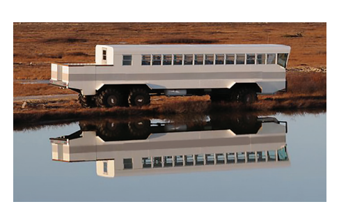
Day 5 Churchill to Via Rail Depart on a Polar Rover tour out onto the tundra, keep your eyes peeled for caribou, eagles,

and other wildlife as well as the unique looking trees. The rest of the day can be spent exploring the town on your own or shopping. This evening we will board Via Rail and head back to Thompson.