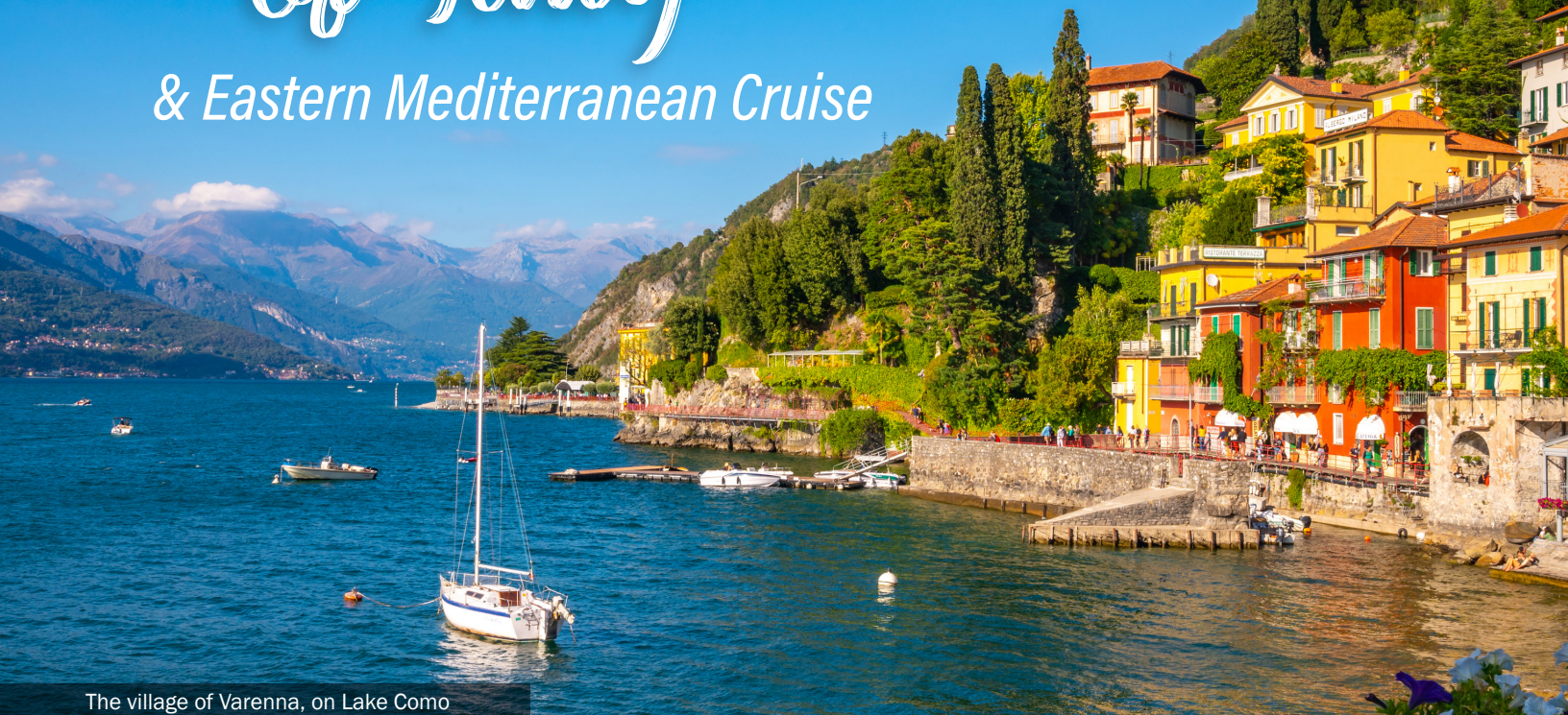
The village of Varenna, on Lake Como

WestWorldTours Where Dependability is a Tradition PRESIDENT'S Collection