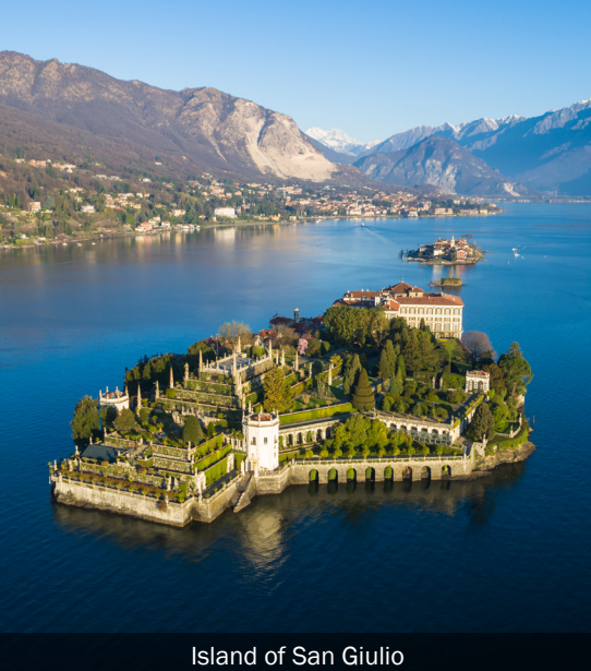
Island of San Giulio