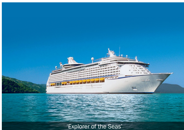
'Explorer of the Seas'

Spend the day exploring all the cruise ship has to offer... spa day anyone?