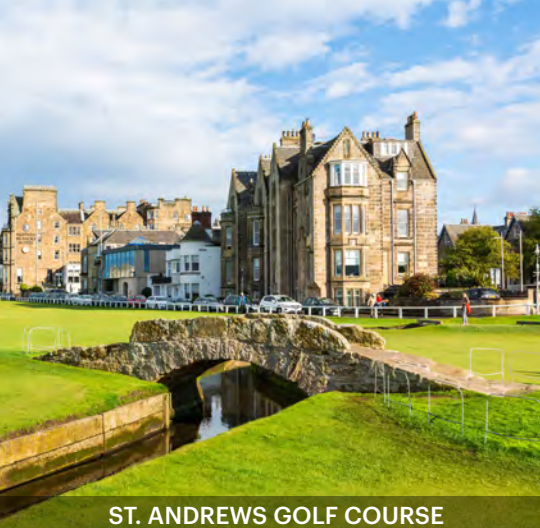
ST. ANDREWS GOLF COURSE