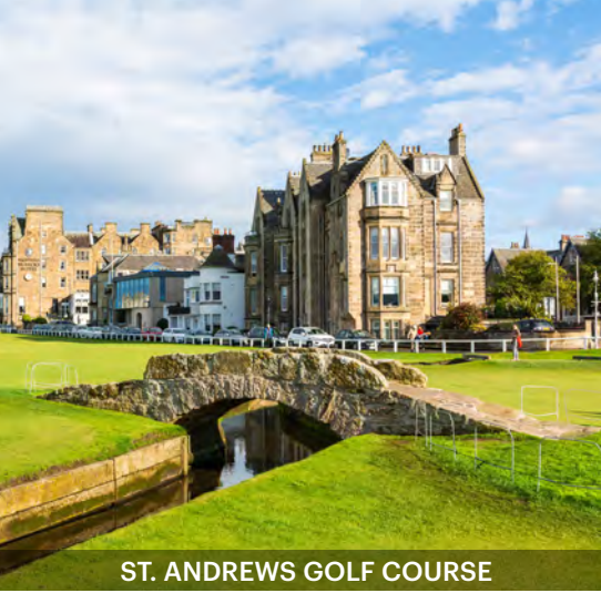
ST. ANDREWS GOLF COURSE