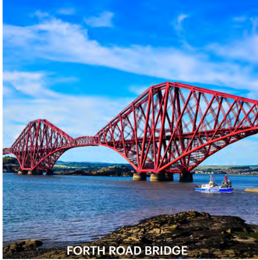
FORTH ROAD BRIDGE