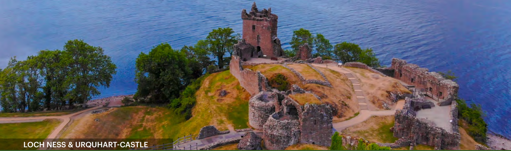
LOCH NESS & URQUHART-CASTLE