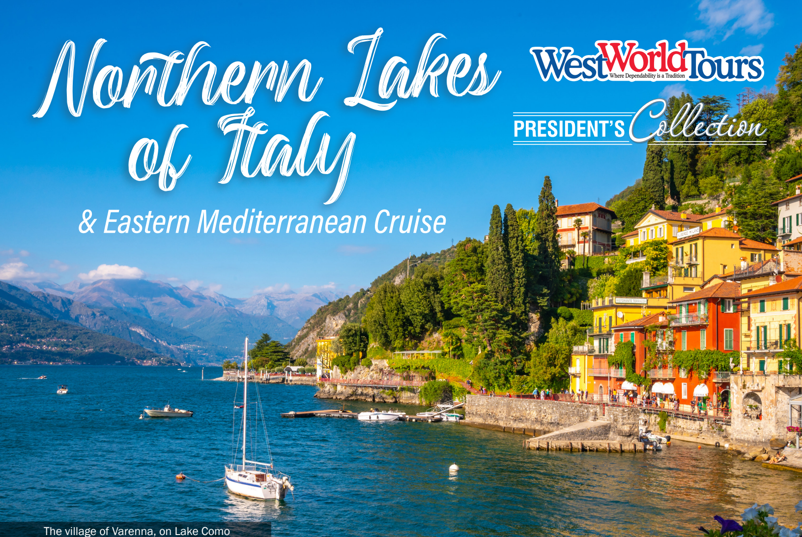
The village of Varenna, on Lake Como