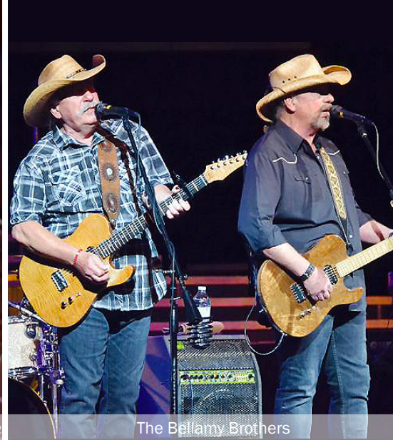
The Bellamy Brothers