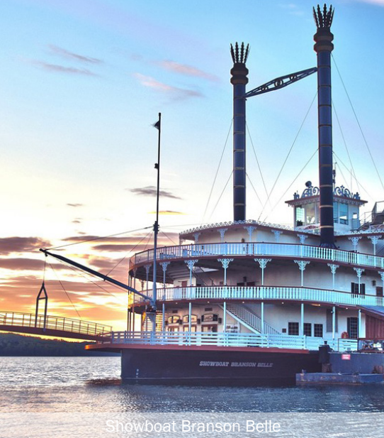
Showboat Branson Belle