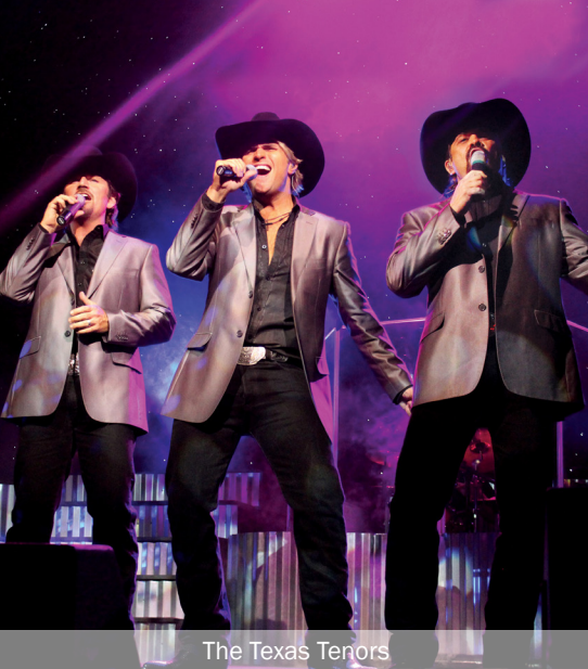
The Texas Tenors