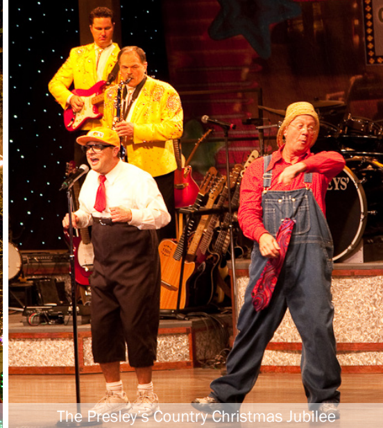
The Presley's Country Christmas Jubilee