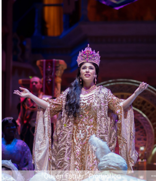
Queen Esther Production