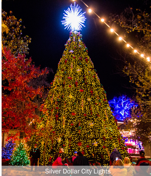
Silver Dollar City Lights