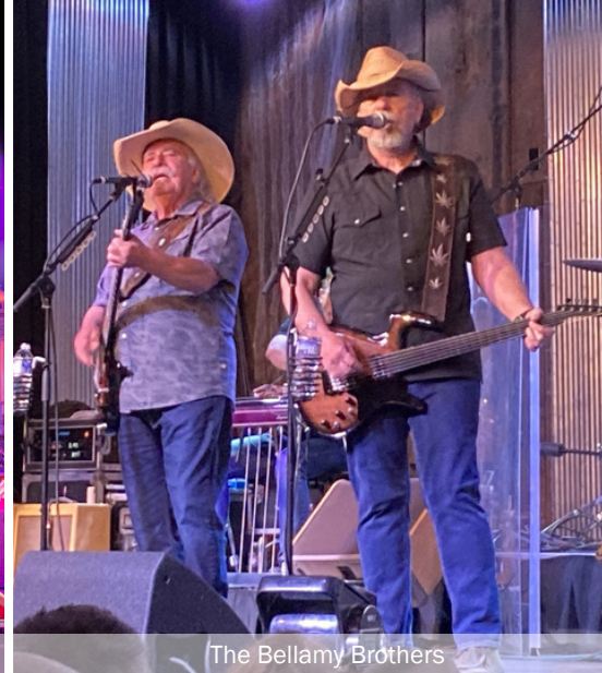
The Bellamy Brothers