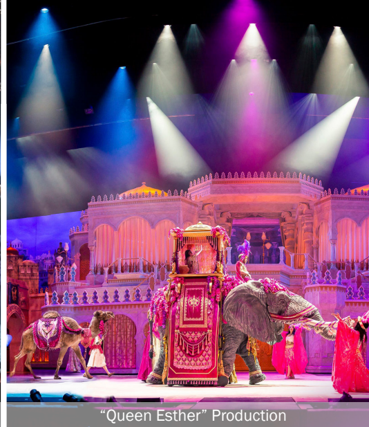
"Queen Esther" Production