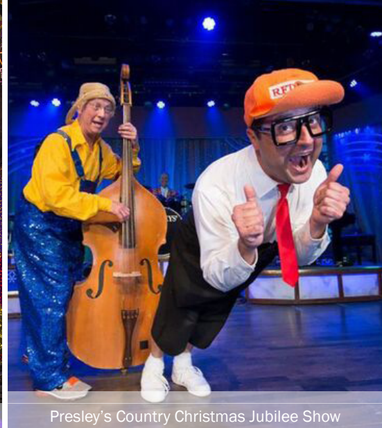
Presley's Country Christmas Jubilee Show