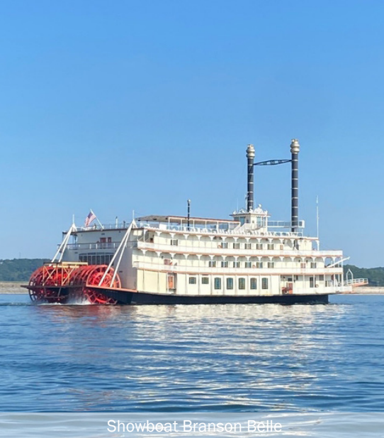
Showboat Branson Belle