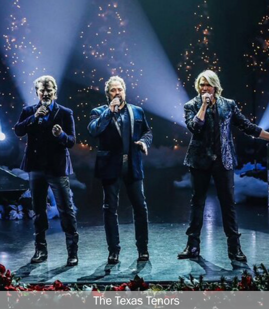
The Texas Tenors