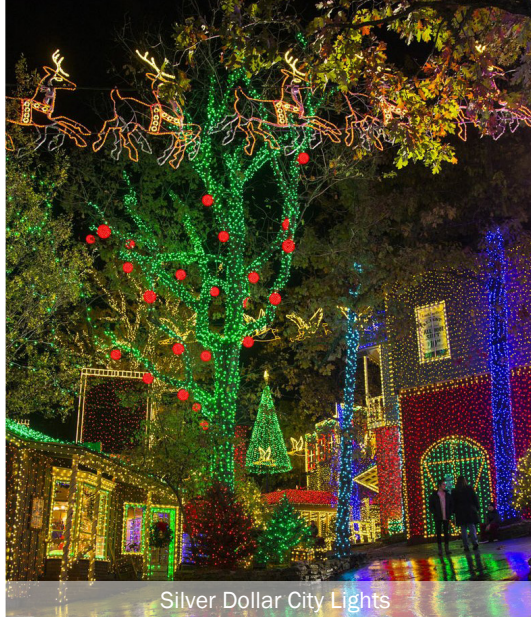
Silver Dollar City Lights