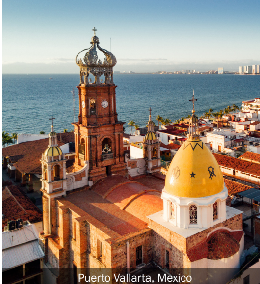
Puerto Vallarta, Mexico