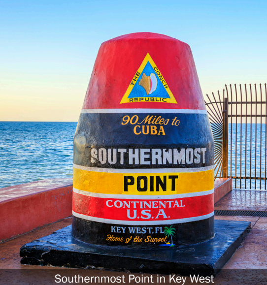
Southernmost Point in Key West