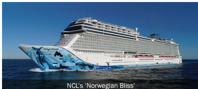
NCL's 'Norwegian Bliss'

Check out of your hotel and transfer to the Cruise Terminal and board your home for the next 15 nights, NCL's 'Norwegian Bliss' . Custom built in 2018 for the spectacular, Norwegian bliss features a revolutionary Observation Lounge, and with 18 different restaurants to choose from and 20 different bars and lounges, finding your favourite may take a few days. Make some time to take in a Jersey Boys show or a game of mini golf, or if you are looking for more of a thrill, why not try out go-cart speedway.