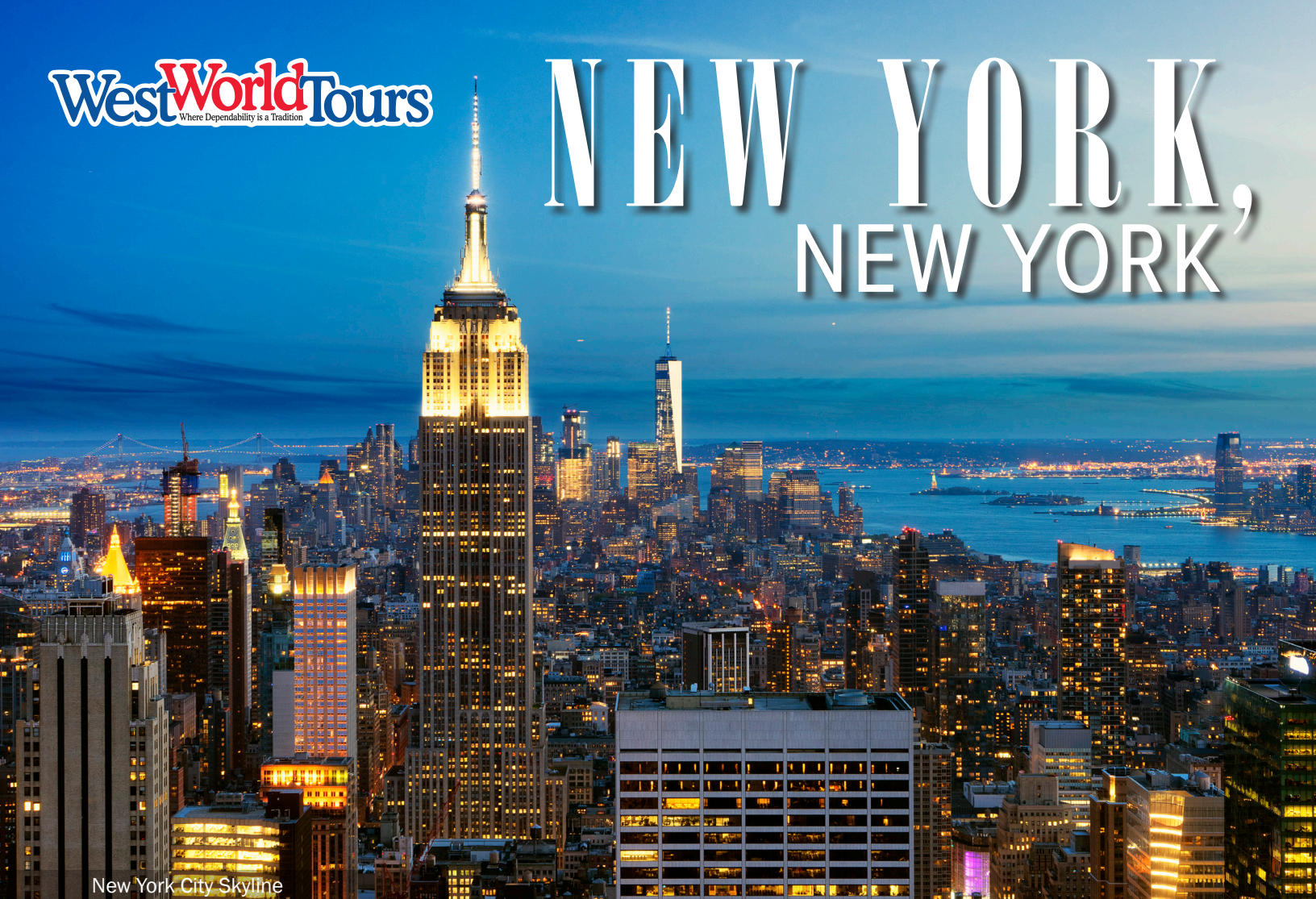
New York City Skyline