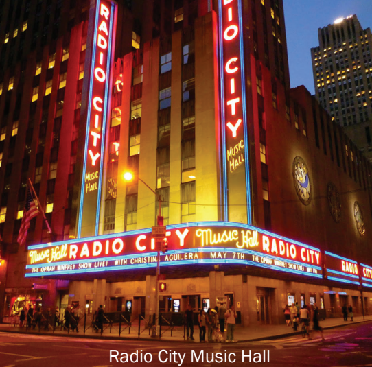
Radio City Music Hall