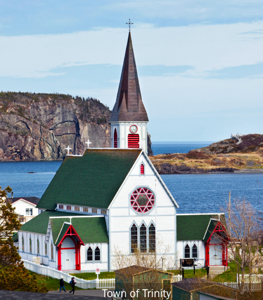
Town of Trinity