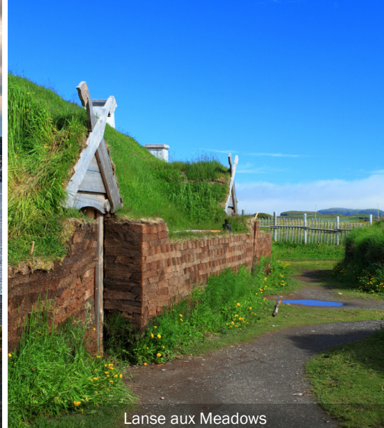
Lanse aux Meadows

landed, changing the way we communicate forever. This little Newfoundland town leapt into the history books and remained a global communications hub for over a century. The cable station is a time capsule of the communications technology that connected us all right up to the 1960s.