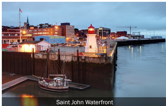
Saint John Waterfront

Enjoy a city tour of Saint John in the morning, then visit the Reversing Falls . If the timing is right, witness this unique phenomenon created by the collision of the Bay of Fundy and the Saint John River, as the Bay's tides rise, they gradually reverse the flow of the river.