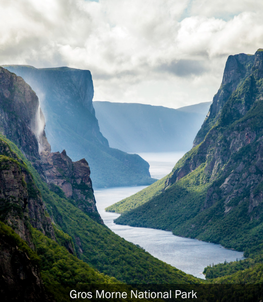
Gros Morne National Park