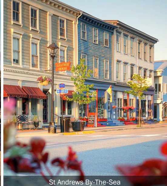
St Andrews By-The-Sea