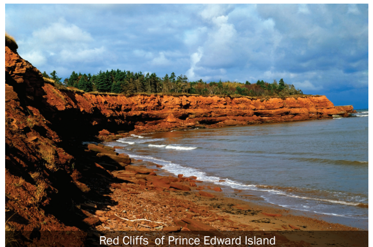
Red Cliffs of Prince Edward Island

Travel by ferry across the Northumberland Strait to PEI and onto Charlottetown, your home, for the next two nights.