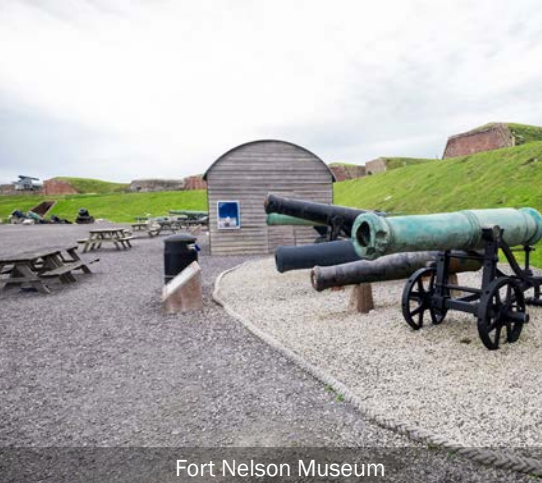
Fort Nelson Museum