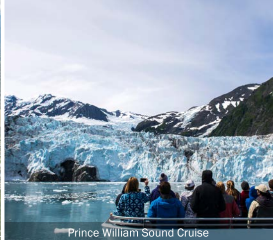
Prince William Sound Cruise