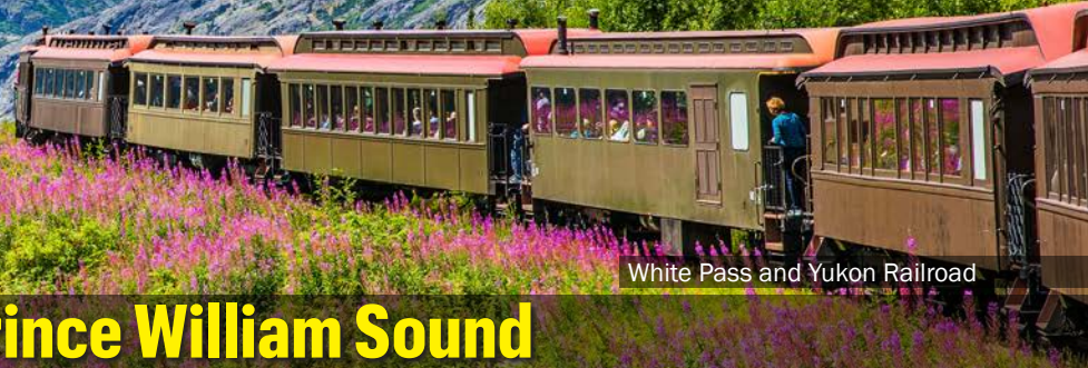
White Pass and Yukon Railroad