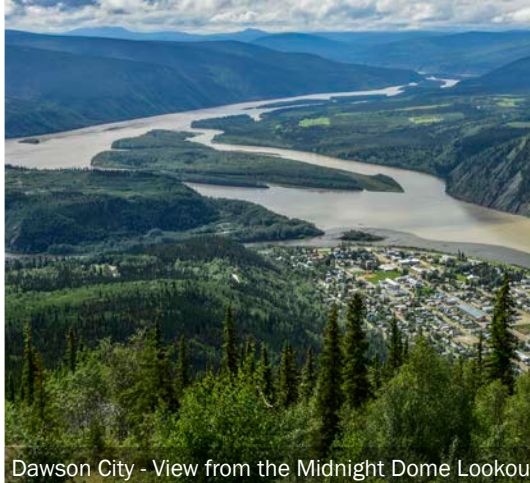
Dawson City - View from the Midnight Dome Lookout