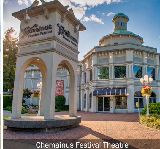
Chemainus Festival Theatre